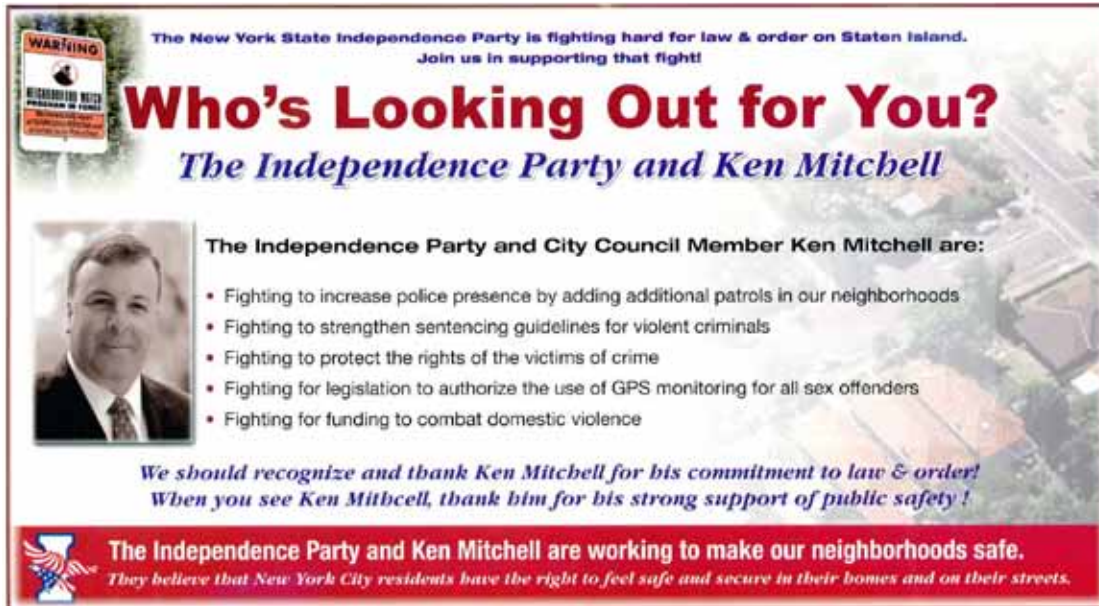
Figure 4: Independence Party Mailer

Disclosure of the sources of the funds behind these efforts was not available to the public until January 2010, when the Independence Party made its semi-annual filing to the State Board of Elections. To ensure that New Yorkers are empowered to cast an informed vote in these elections, recent experience clearly illustrates the need for rules that are written broadly, to require timely disclosure for spending on electioneering communications.