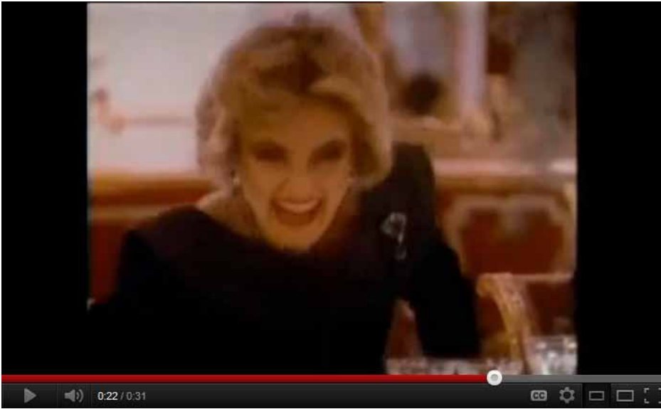
Figure 3: NYC Is Not For Sale Television Ad